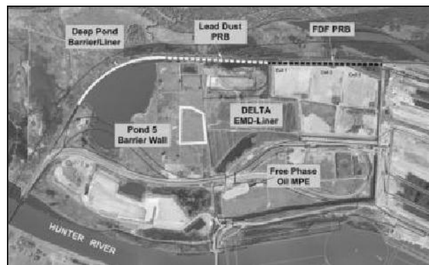
Figure 3. Remediation Plan.

An overall plan showing the location and extent of the preferred remediation options is presented in Figure 3.